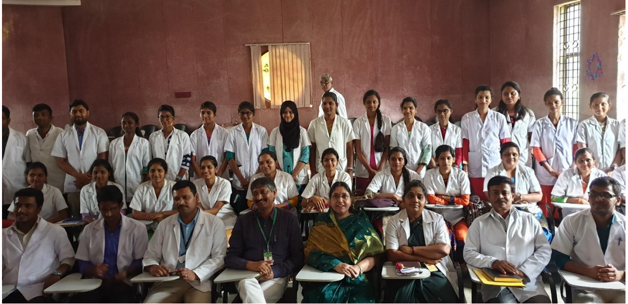
Photo with the Winners of Chart Making Competition